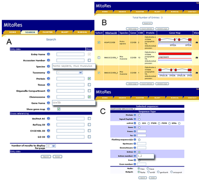
Figure 2 Database search form, query result page and sequence export form. A) Search form. The "i" button provides information on how the search field can be used. The "Show" check box provides the possibility to include (checked) or exclude (unchecked) information on the relevant field in the query result page. The search fields "Entry name", "Accession Number", "Species", "Chromosome", "Gene name" and database "Cross-referencing" accept lists of search terms. B) Query result page. Results are displayed as a table summarising information on retrieved entry on the basis of data field chosen in the query form. The "View" button, when pressed, shows the MitoRes entry view. The "Select page"/"Deselect page" buttons allows the selection/deselection of retrieved records for the export of associated sequences. The "Export selected" and "Export all" buttons provide access to the sequence export form for the extraction and export of selected records or of all retrieved records respectively. C) Sequence export form. Selected record/s for sequence export is/are listed at the top. The "i" button provides information on how the extraction of each sequence can be performed. Check boxes at the bottom allow users to choose the mode and sequence file format for export.

The advanced search form (Figure 2A) allows users to browse and search the database through the use of different categories of data. Users can search the database using any of these data categories or different combinations and access MitoRes entries, satisfying the query criteria, from the query results page (Figure 2B).