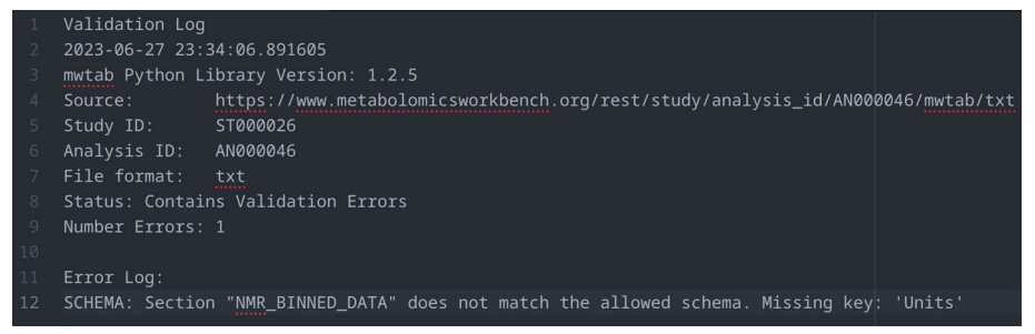
Fig. 2 Example Validation Log Created by the mwtab Python Package. Validation logs are created by calling the ~ mwtab.validate_file() method. The validation log consists of metadata surrounding when and the conditions the validation was performed, metadata identifying the Metabolomics Workbench analysis data file the validation was performed on, and the number of validation errors collected if any